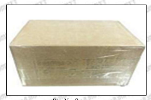
Pic No.2 Domestic express packaging: Wrapped by Transparent tape

A Minors are prohibited from using transparent tape, yellow tape, black wrapping protective film, and white wrapping protective film to avoid personal injury.